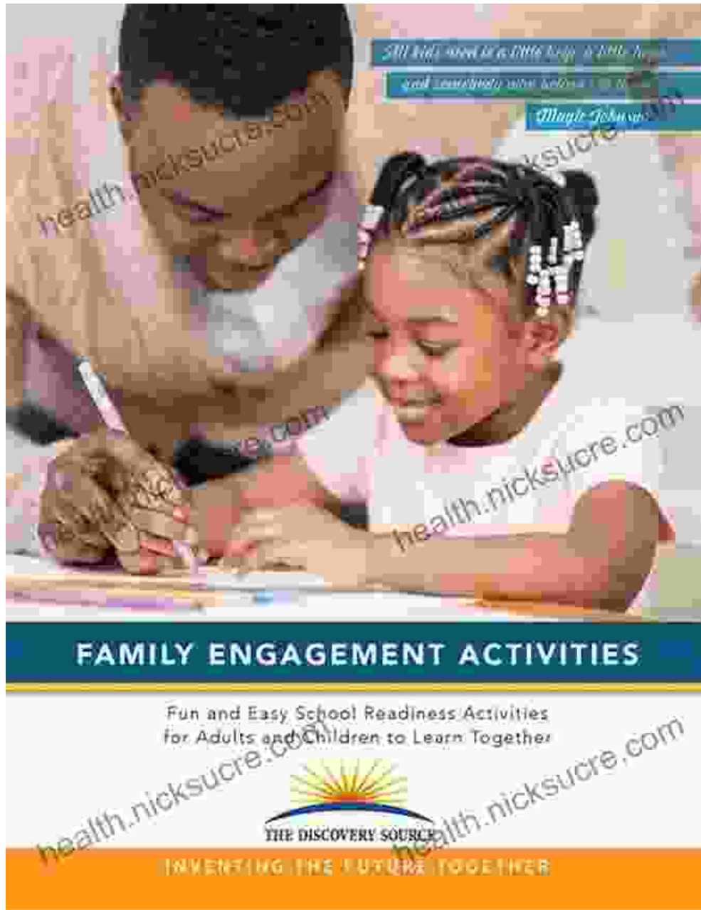
Image Caption: A photograph depicting a homeschooling family working together in a home learning environment.